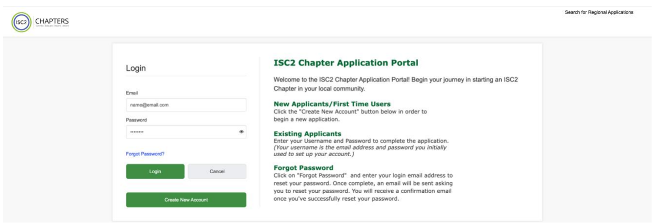
Shown above: ISC2 Chapter Application Portal (powered by CommunityForce)

Once you've determined you are eligible and no chapter exists in your desired location, then complete and submit an application via <a href="ISC2s Chapter Application Portal">ISC2s Chapter Application Portal</a>. First, you will need to create an account for your proposed chapter in the system with an email address you plan to use for ongoing chapter communications. You will use this system throughout the entire chartering process.